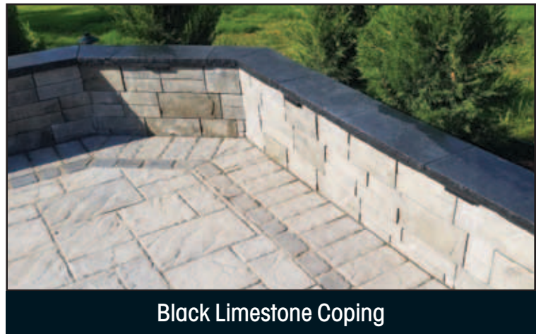
Black Limestone Coping