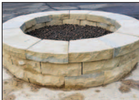
Honey Brook Buff