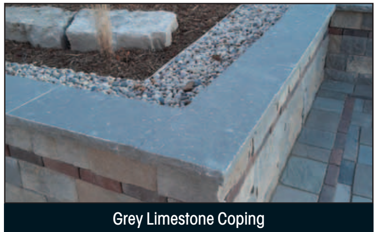
Grey Limestone Coping