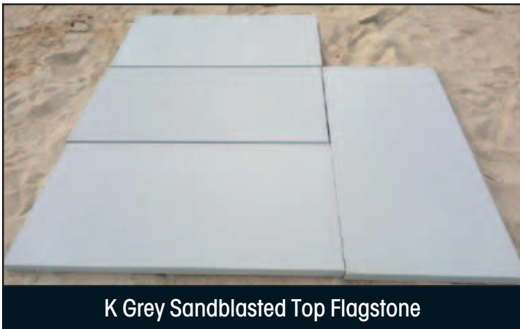
K Grey Sandblasted Top Flagstone