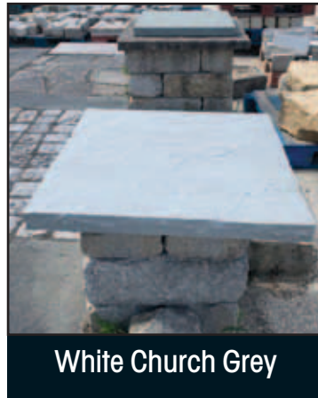
White Church Grey