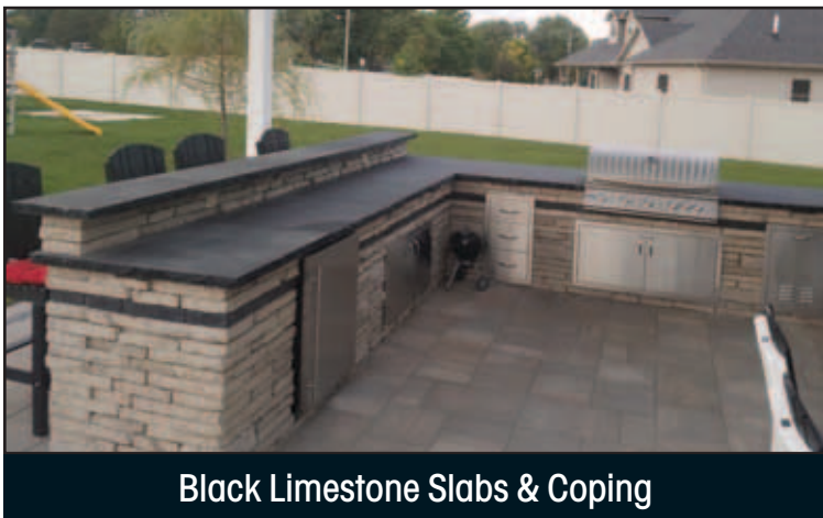
Black Limestone Slabs & Coping